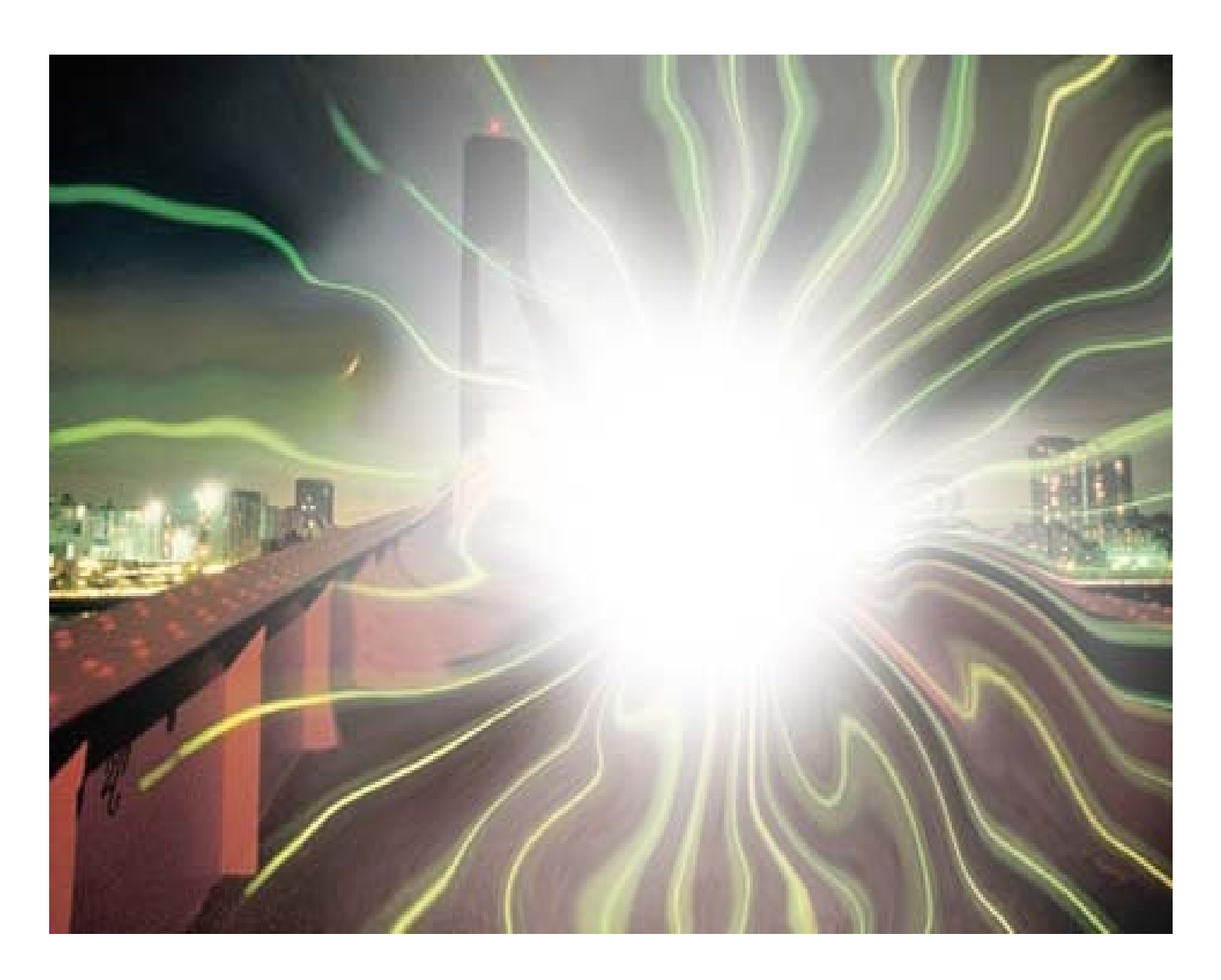
Fig. 2 Projection Bombing

Light-Designers, Light-Architects, Light-Engineers und all sorts of Light-Artists 'dance the night away'. High-Intensity – LED – (HI-LED) spots, embedded in pavements, ramps and streets emit light into the cosmos. Futile. The beams are targeted at the stars. The desired promotional effects equal zero. Those inverted, amiss foodlights blind and irritate pedestrians, cyclists, bikers and other traffic participants as well. Luminous advertising of all kinds, 'dynamic', flashing and blinking, inapt street lighting, imperfect accent- and effect-lighting, food lighting, bright skyscraper-illumination, 'decorative'-bridge-lightings, lighting installations for 'mega-events', night-skiing-slopes, sky-beamers, laser shows, blazing jumbo fireworks in increasing numbers, chintzy illumination of waterfalls – in candy colors –, light graffti (in the streets, in nature), projection bombing (Fig. 2) 'madness' (modern hooligan 'fun'), systematic light- 'embellishments' ('Behübschung') for whole towns – inexcusable waste of public money.