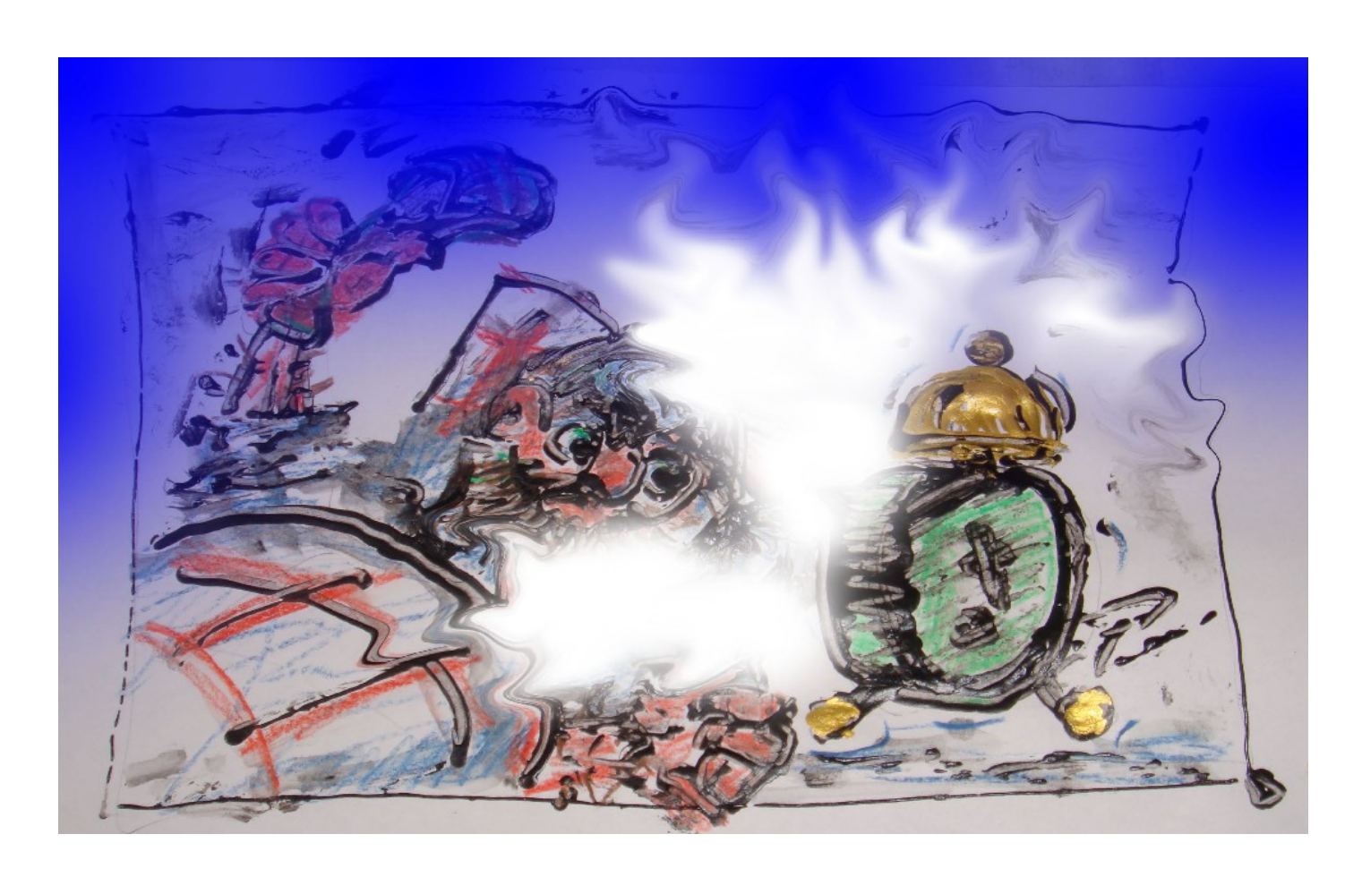
Fig.3 Blue - Light - Alarm - Clock